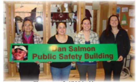
The new sign for VPSO building.

For each additional household member, add $877