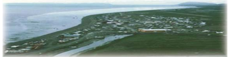
Aerial photo of Togiak.

In the beginning of fiscal year 2011, Togiak Traditional Council adopted an authorizing resolution to return all of its BIA Contract Programs to the BBNA Compact. This action followed a recommendation made by the Tribal Administrator to the Togiak Tribe. Returning the Compact programs allows the Togiak Tribe to again offer other services to benefit its Tribal Members through the BBNA programs.