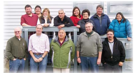
Alaska Migratory Bird Co-Management Council.

The Alaska Department of Fish & Game (ADF&G) and BBNA Subsistence program through AMBCC will be holding a Field Coordinator Training for the 2011 Migratory Bird Subsistence Harvest Survey project held in Dillingham spring 2011 involving 17 communities. The survey project will start this spring involving local research assistants from 17 Bristol Bay communities including Alaska Peninsula.