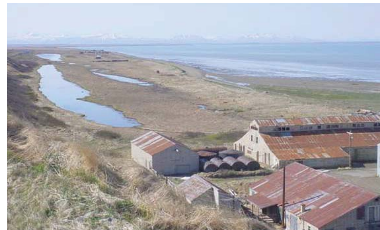
Pilot Point's Brownfield.