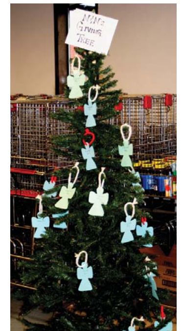
N&N's Giving Tree.

The trees are up at other agencies and various community members and organizations who work with us again in providing gifts to children throughout the region. If you see an Angel Tree at one of the local stores, be sure to take one and buy a gift for a child or two!