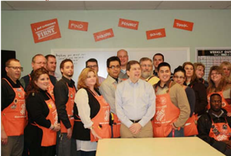
January 2012 - Sen. Begich meets with staff and managers of Alaska's Home Depot stores in Anchorage.

With a focus on jobs and economic recovery, the Senate is back in session this week. We have much on our upcoming agenda, including reauthorization of the Federal Aviation Administration, which is vitally important to Alaska with more pilots per capita than any other state. I am also hopeful we'll soon agree on a transportation package to fund highway and road improvements putting thousands of Americans to work.