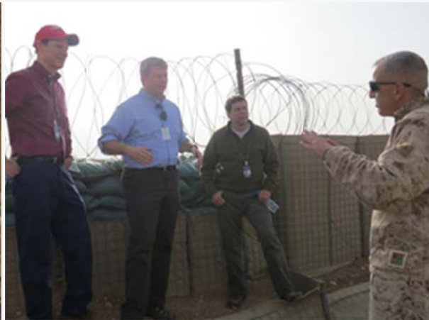
January 14, 2012 - Sen. Begich meets with marines at Patrol Base Boldak in Afghanistan's Helmand Province. Also pictured is Sen. Ron Wyden of Oregon and Rep. Bill Huizenga of Michigan.